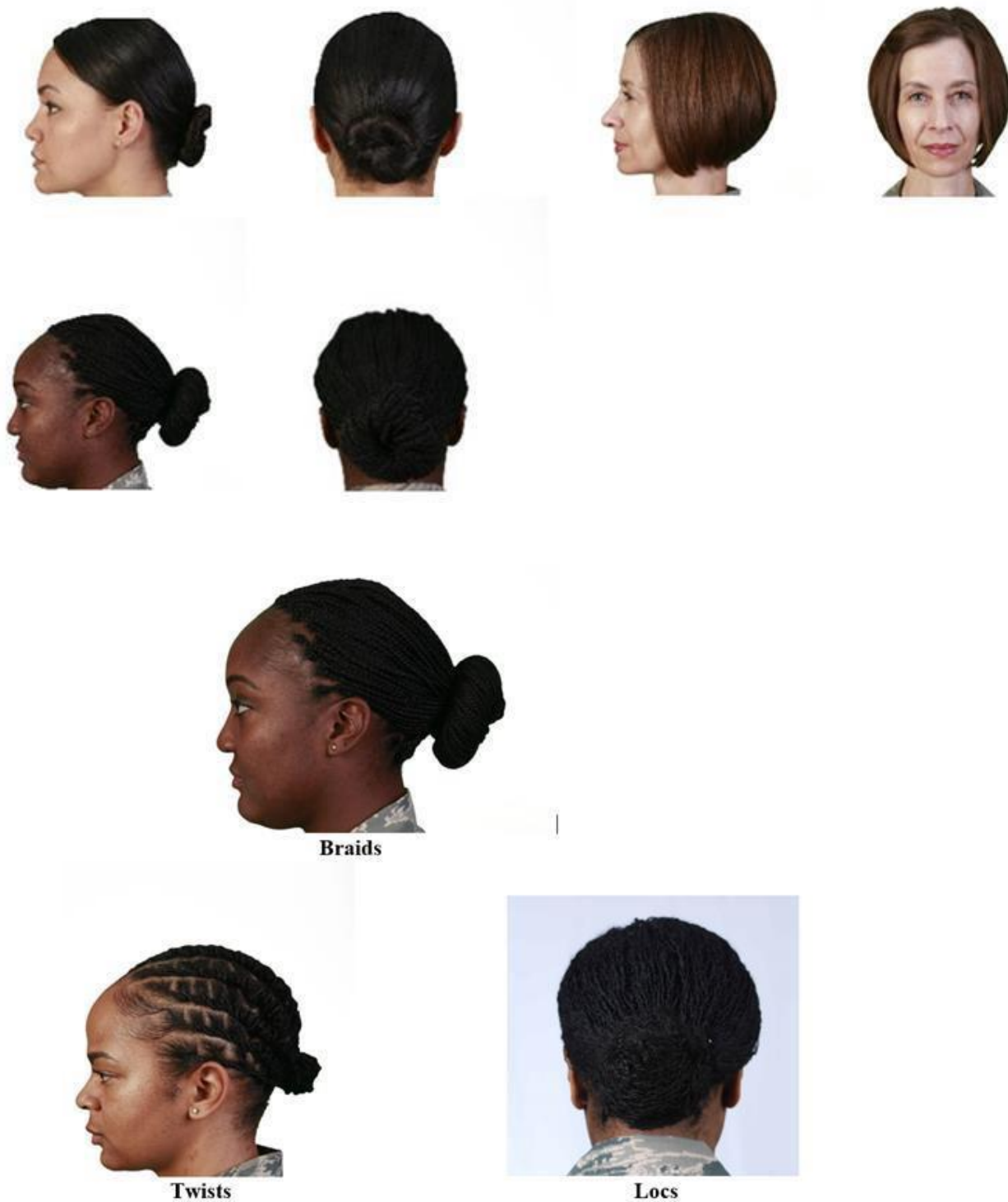
Figure 3.2. Female Hair Style Examples