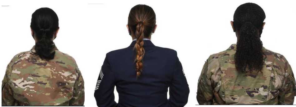
Ponytail/Pull-through Ponytail Style/Braided Ponytail

Authorized Female Ponytails/equivalent and long braid(s) Hair Styles Examples.