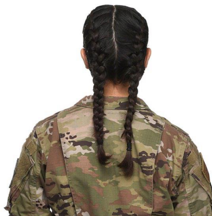
Two Braids Looped Underneath/Two Braids