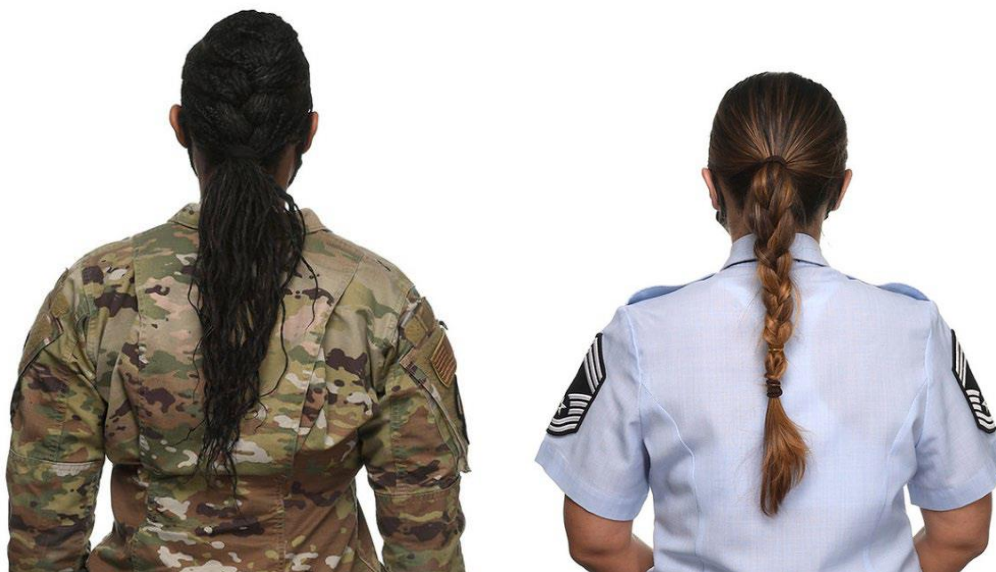
Exceeds Length Requirement