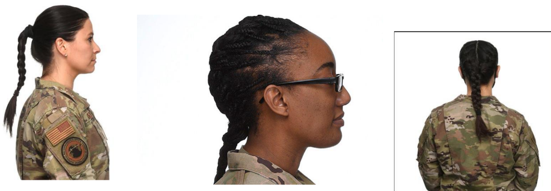
Braided Ponytails/Multiple Braids in a Single Ponytail