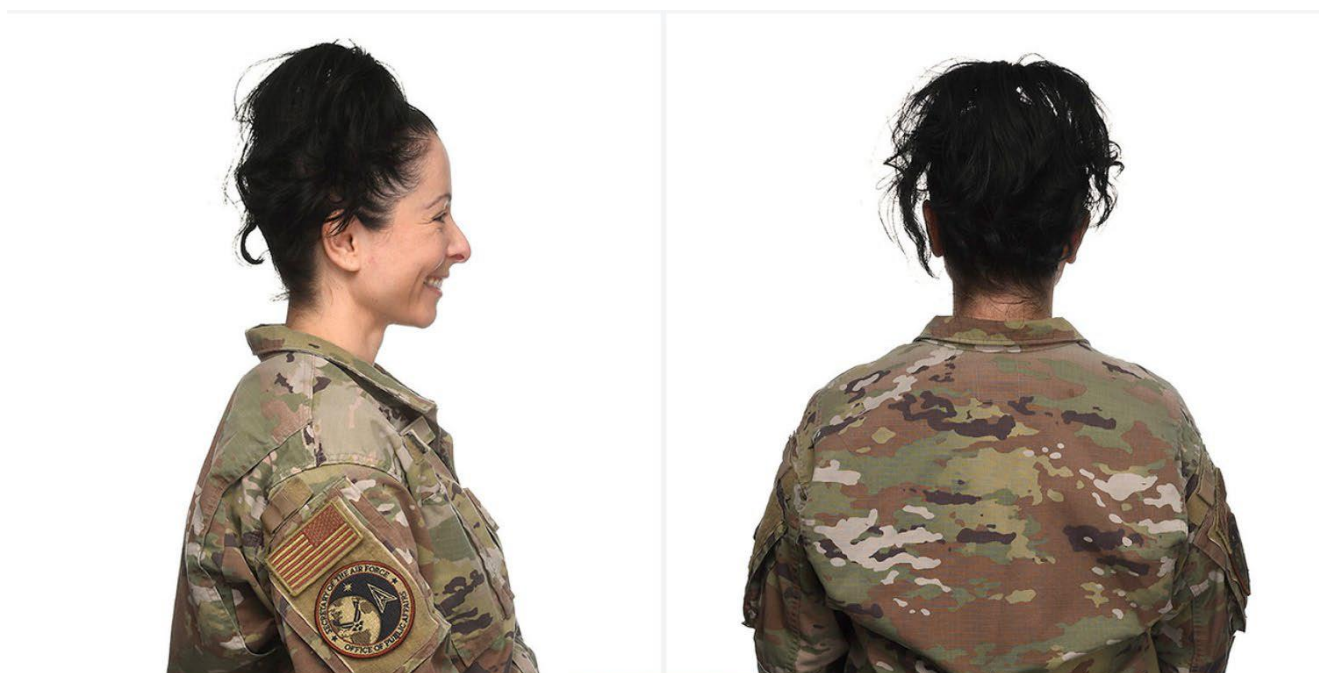
Ponytail Fasten on the Crown of Head