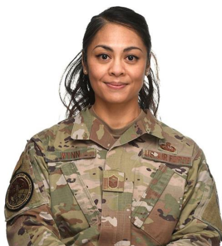
Pulled back secured and does not exceed 6-inch radius